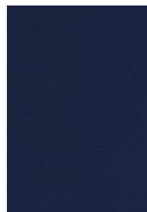
Ocean blue 027