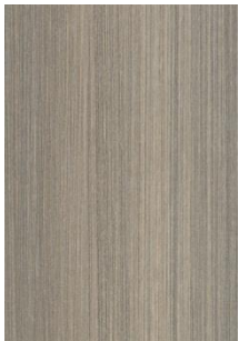
Mystic Wood 130