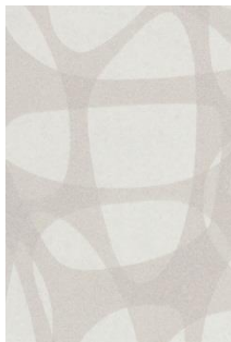
Fancy Pearl 136