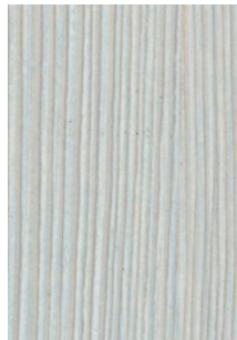
White Larch 132