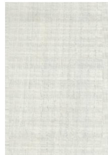
White Oak 133