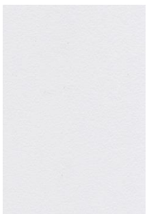
Ice white 012